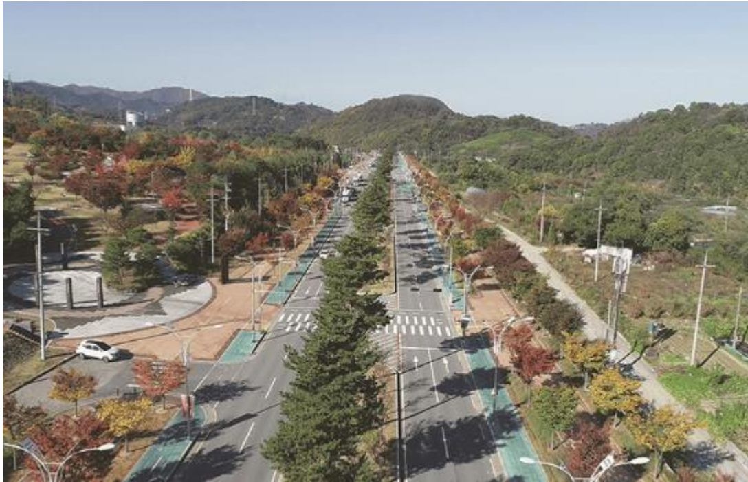
Road Walks Course Daegu